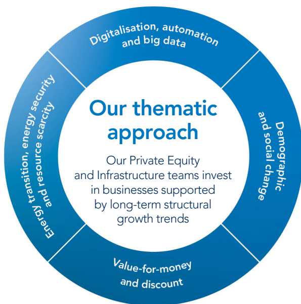
+ PAGES 16-17 Our thematic approach